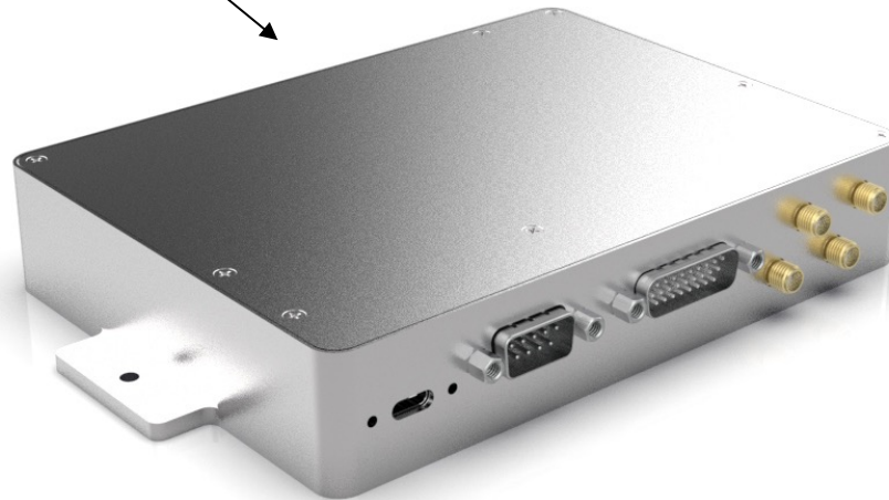
Business IFE Business Inflight Entertainment System 551-7007-001